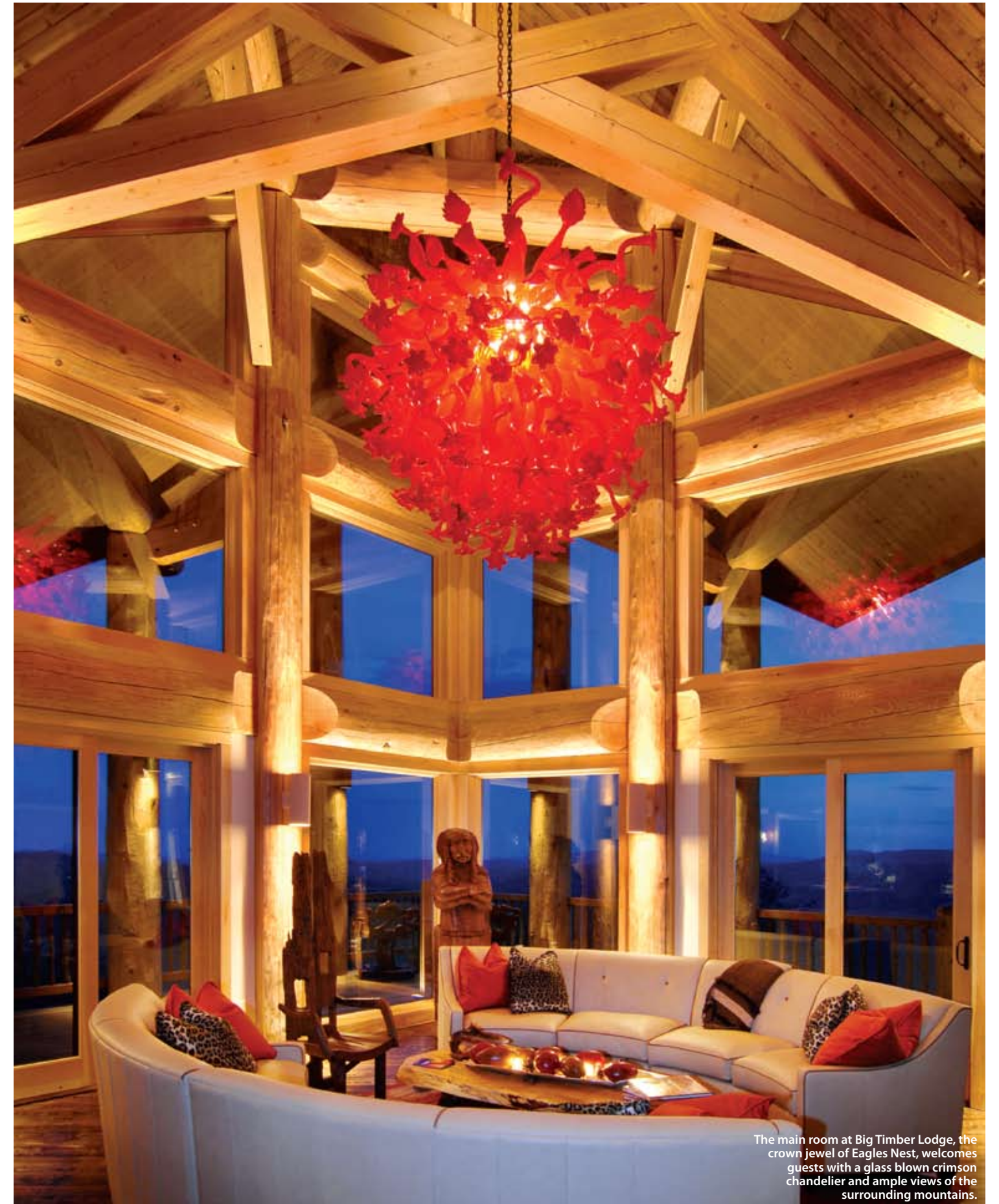
The main room at Big Timber Lodge, the crown jewel of Eagles Nest, welcomes guests with a glass blown crimson chandelier and ample views of the surrounding mountains.