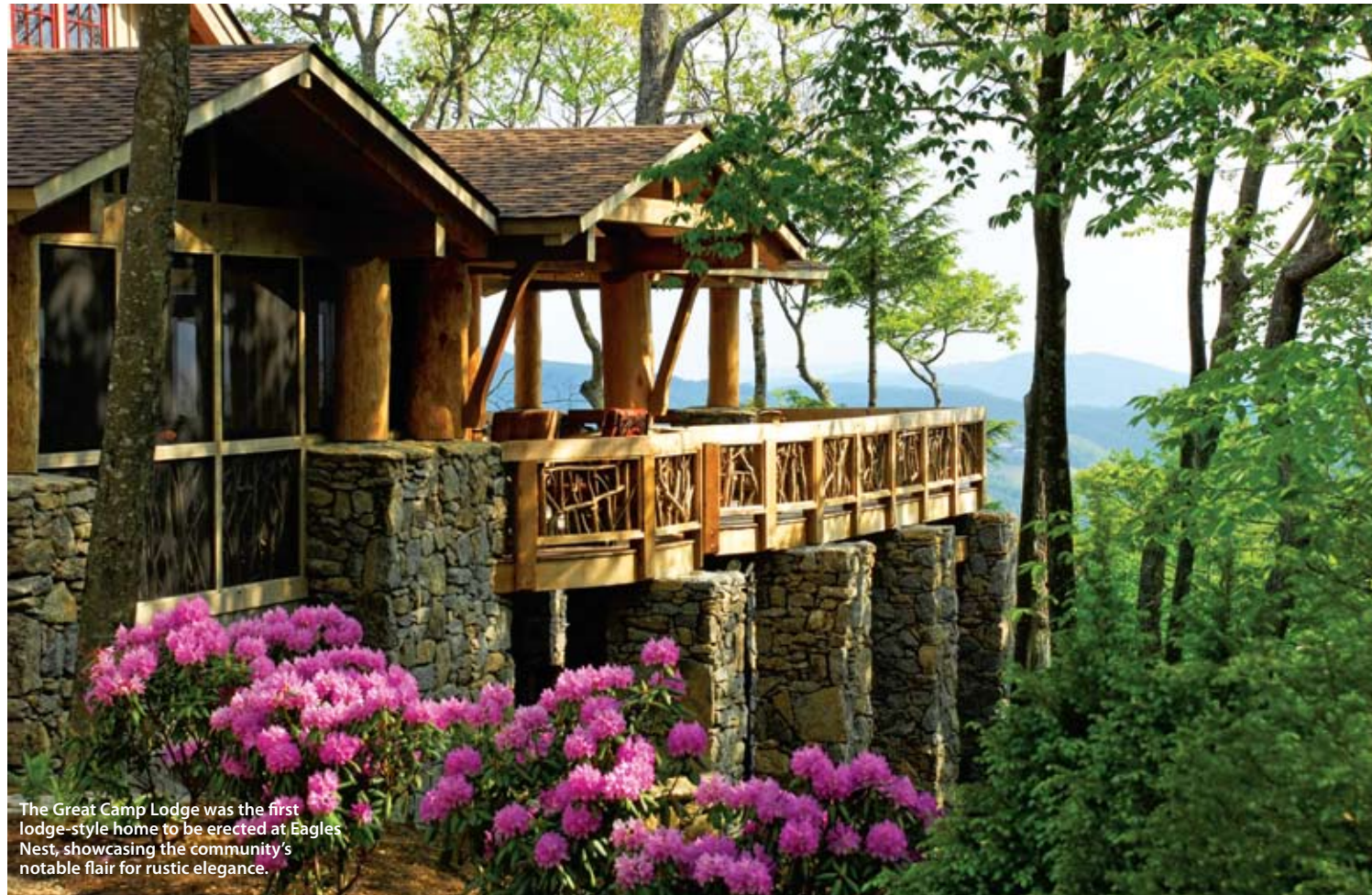
The Great Camp Lodge was the first lodge-style home to be erected at Eagles Nest, showcasing the community's notable flair for rustic elegance.