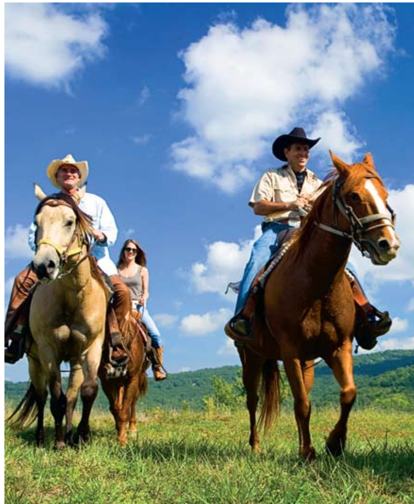
The pure joy of riding is one of the advantages of Eagles Nest.

The Lodges at Eagles Nest offers a wide range of unique amenities and home designs creating a family-oriented residential mountain retreat that stands out for its flair of rustic elegance.