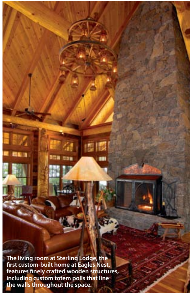
The living room at Sterling Lodge, the first custom-built home at Eagles Nest, features finely crafted wooden structures, including custom totem poles that line the walls throughout the space.