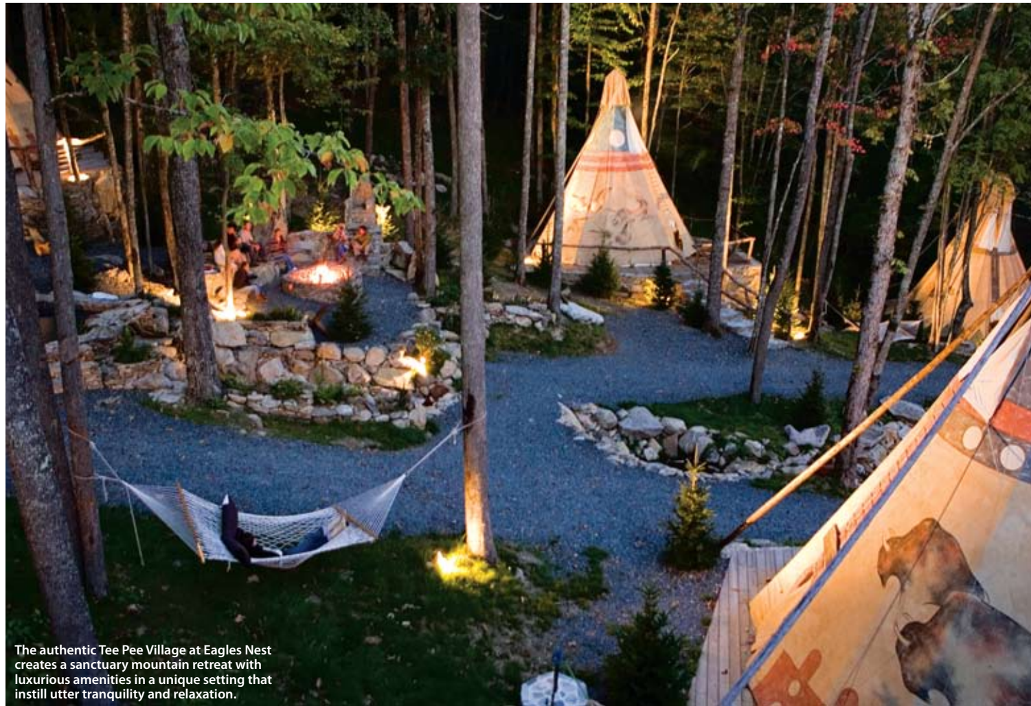
The authentic Tee Pee Village at Eagles Nest creates a sanctuary mountain retreat with luxurious amenities in a unique setting that instill utter tranquility and relaxation.