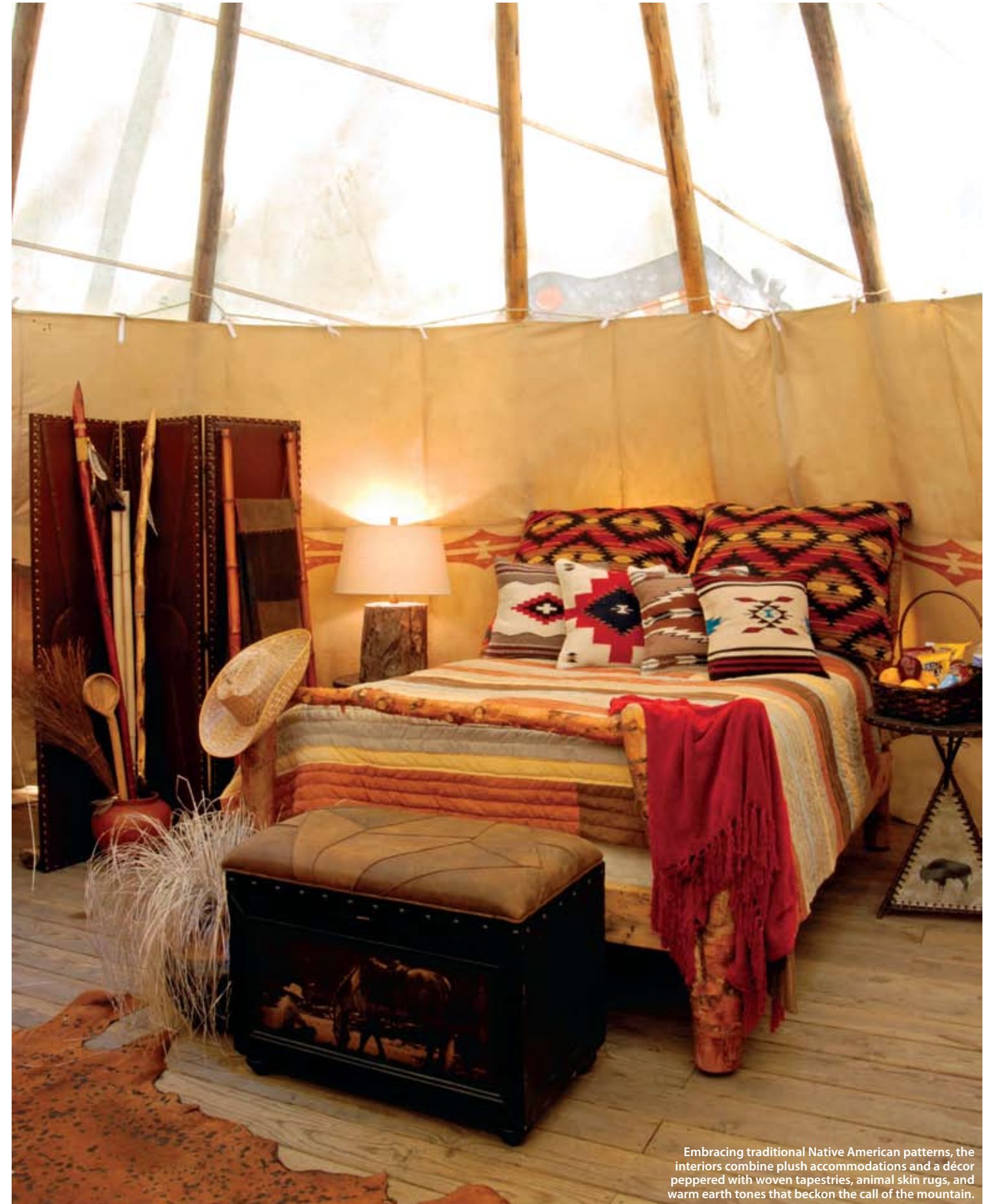
Embracing traditional Native American patterns, the interiors combine plush accommodations and a décor peppered with woven tapestries, animal skin rugs, and warm earth tones that beckon the call of the mountain.