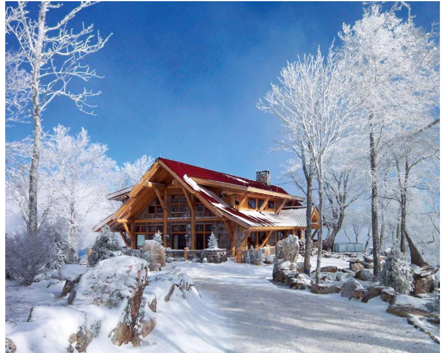
Hidden amid a frosted landscape, the Sterling Lodge sits on the apex of the mountain at 5,200 feet, yielding 360 degrees mountainous views.