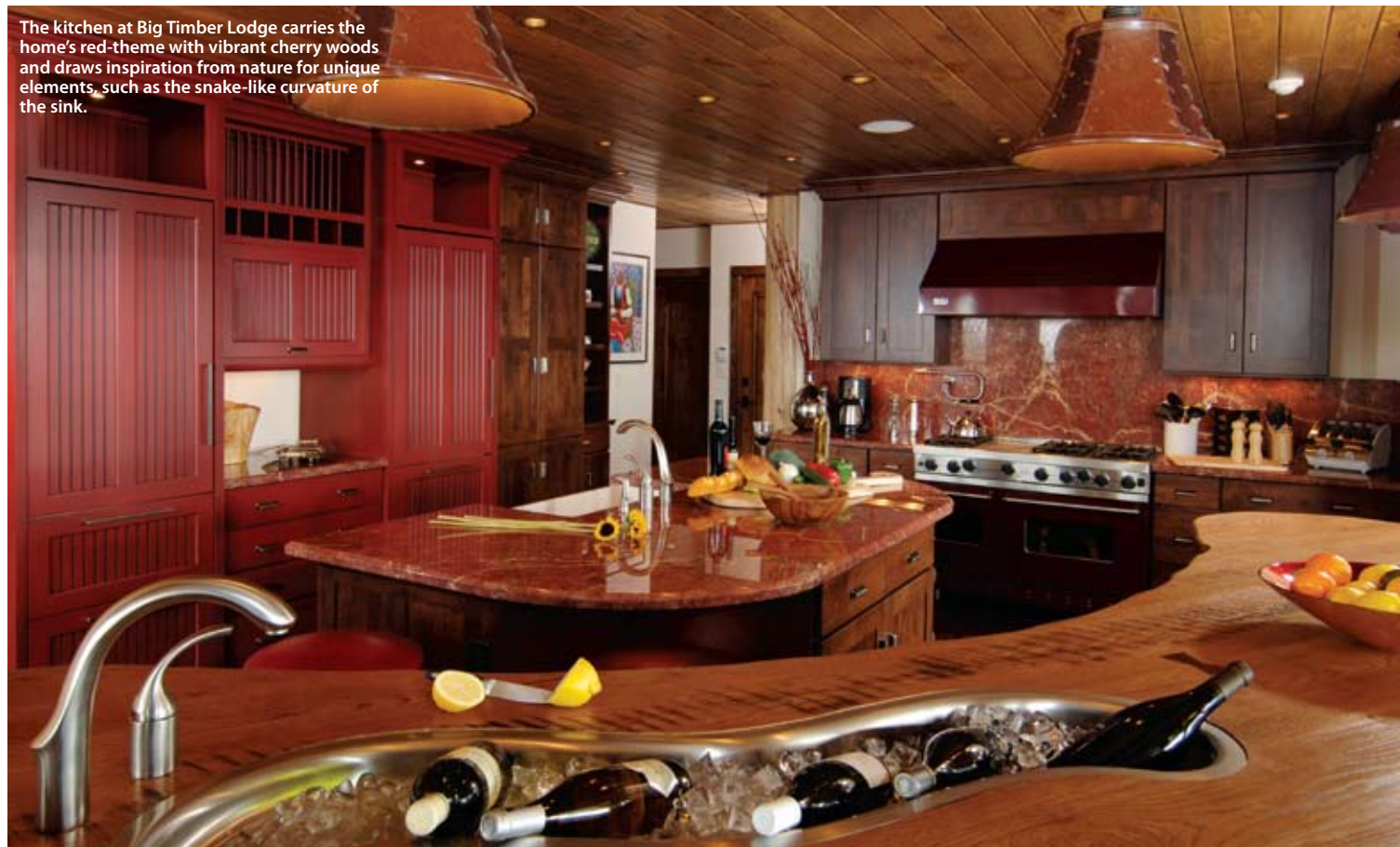
The kitchen at Big Timber Lodge carries the home's red-theme with vibrant cherry woods and draws inspiration from nature for unique elements, such as the snake-like curvature of the sink.