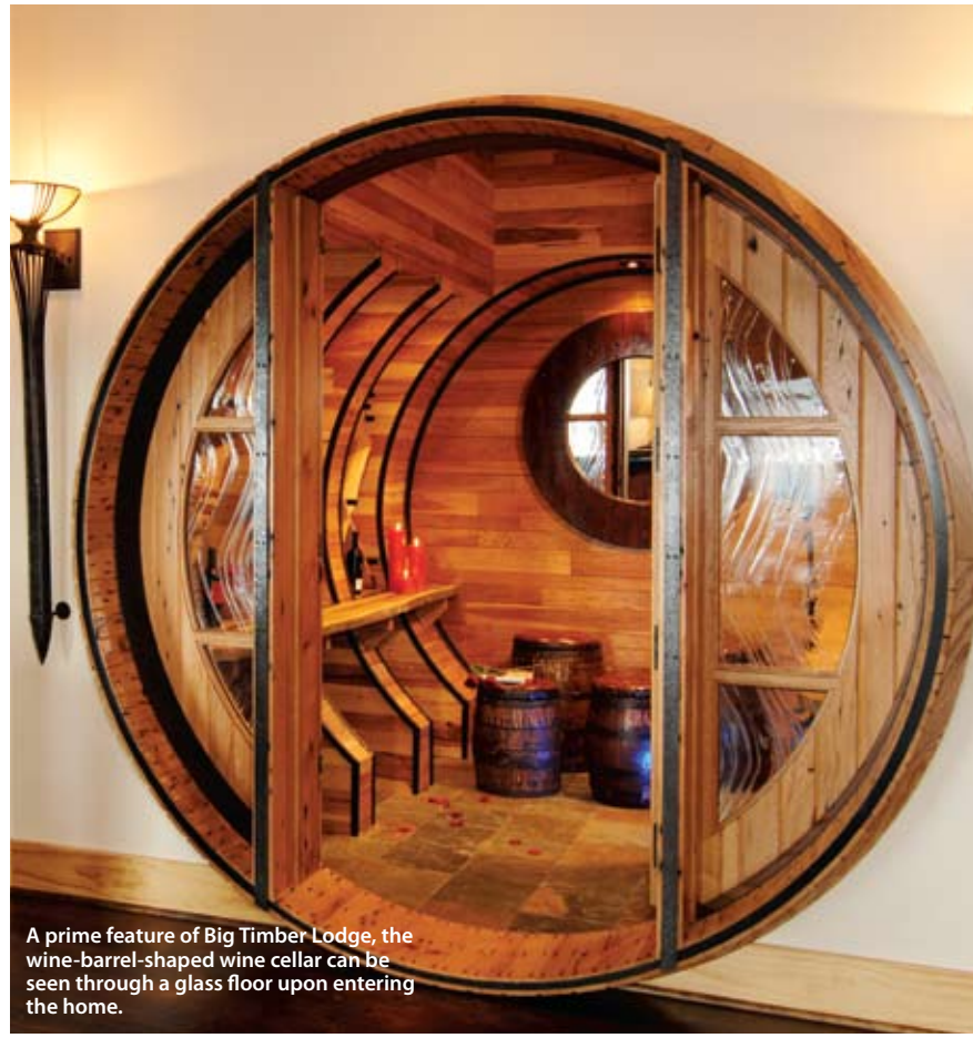
A prime feature of Big Timber Lodge, the wine-barrel-shaped wine cellar can be seen through a glass floor upon entering the home.