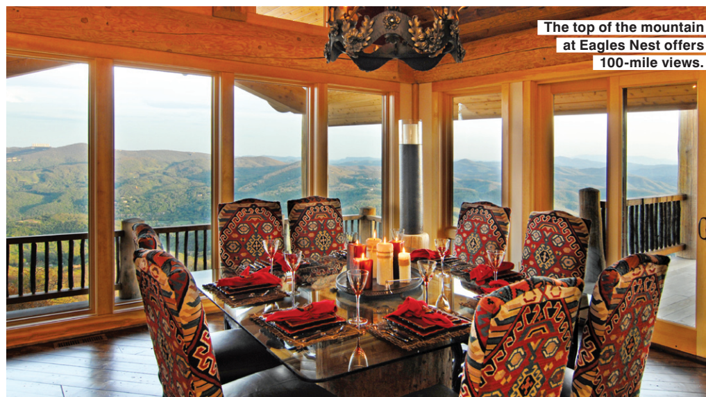
The top of the mountain at Eagles Nest offers 100-mile views.